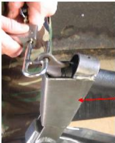
TACOM butt stock restraining device