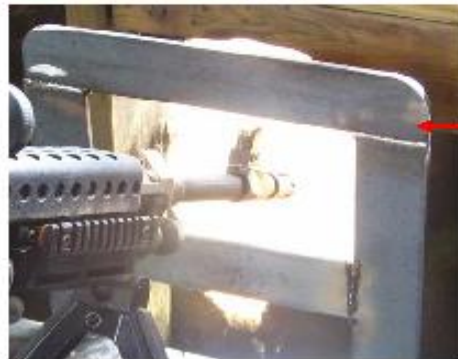
Barrel restriction device

Place gun and pintle into MK 64 Mount. (Note: Barrel must go into barrel restriction device first.) Lift up on weapon to ensure pintle is locked into MK 64.